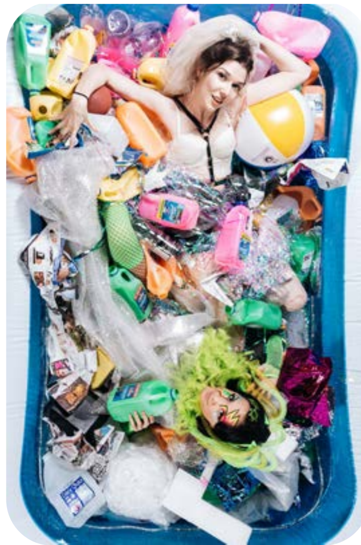
Trash Island Installation at the Heaps Gay Trash Palace, Sept 2018