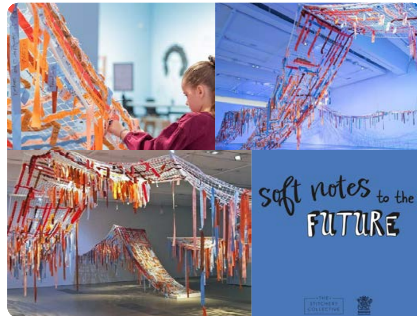
Installation Views and audience adding their stories at 'Soft Notes to the Future', Rockhampton Museum of Art, 2022.

Solo exhibition | Rockhampton Museum of Art, Queensland