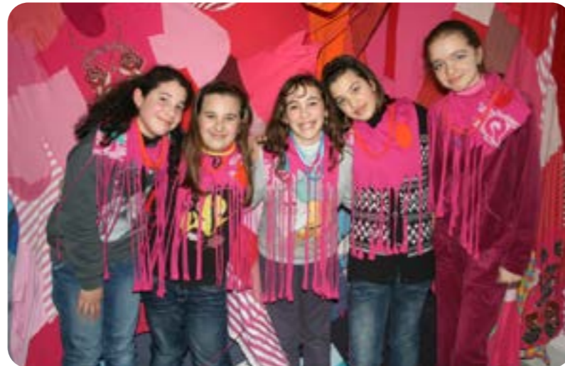
Workshop participants enjoying their creations.

Nominated and sponsored by Arts Queensland and the Australia Council for the Arts.