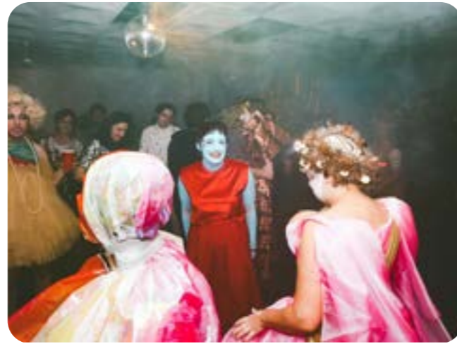
Bowery Bowl, October 2016