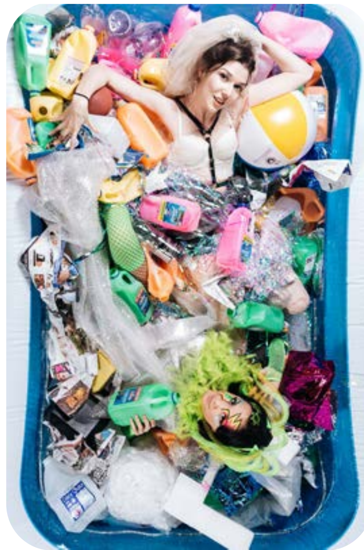
Trash Island Installation at the Heaps Gay Trash Palace, Sept 2018