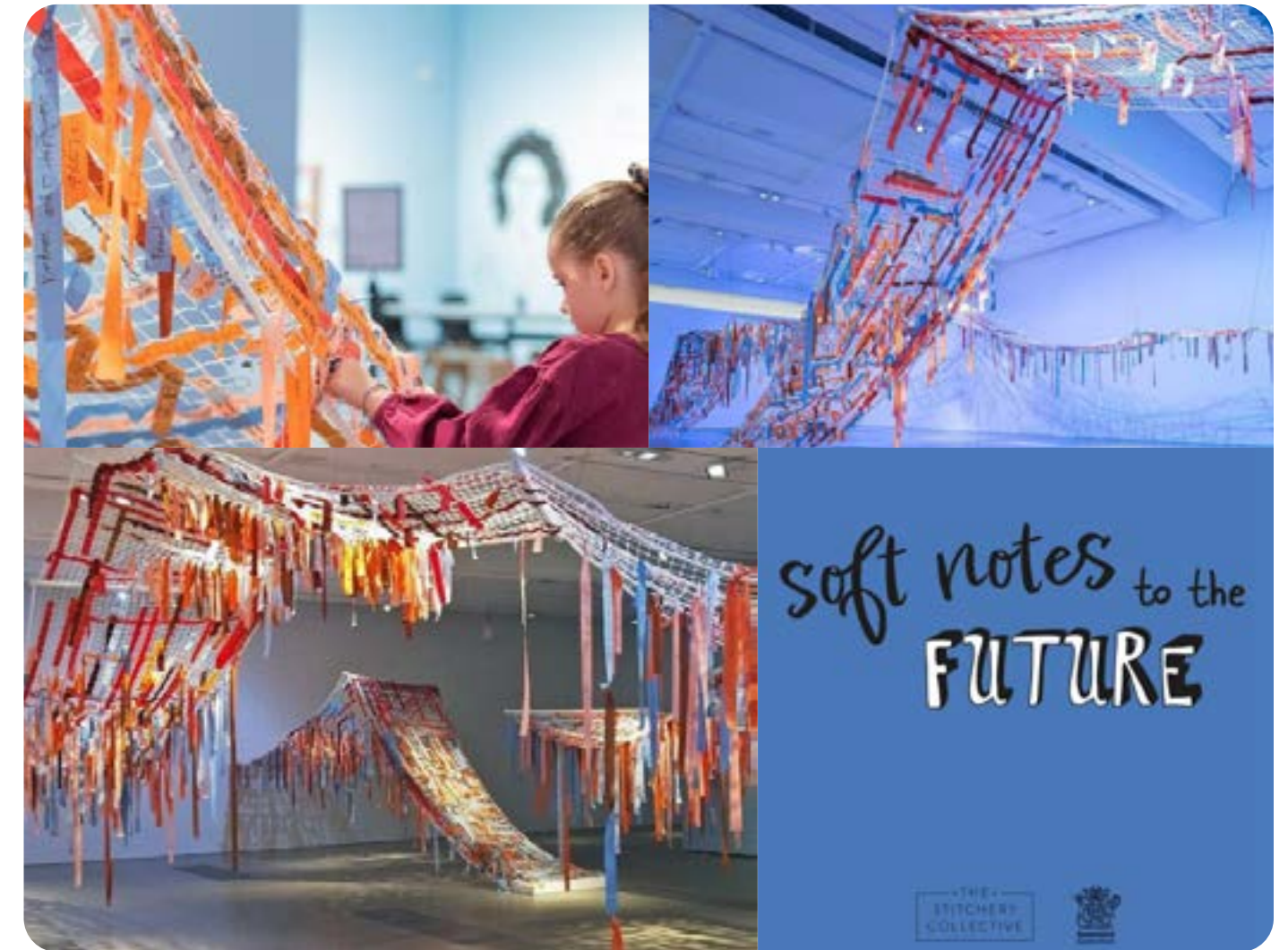
Installation Views and audience adding their stories at 'Soft Notes to the Future', Rockhampton Museum of Art, 2022.

Solo exhibition | Rockhampton Museum of Art, Queensland