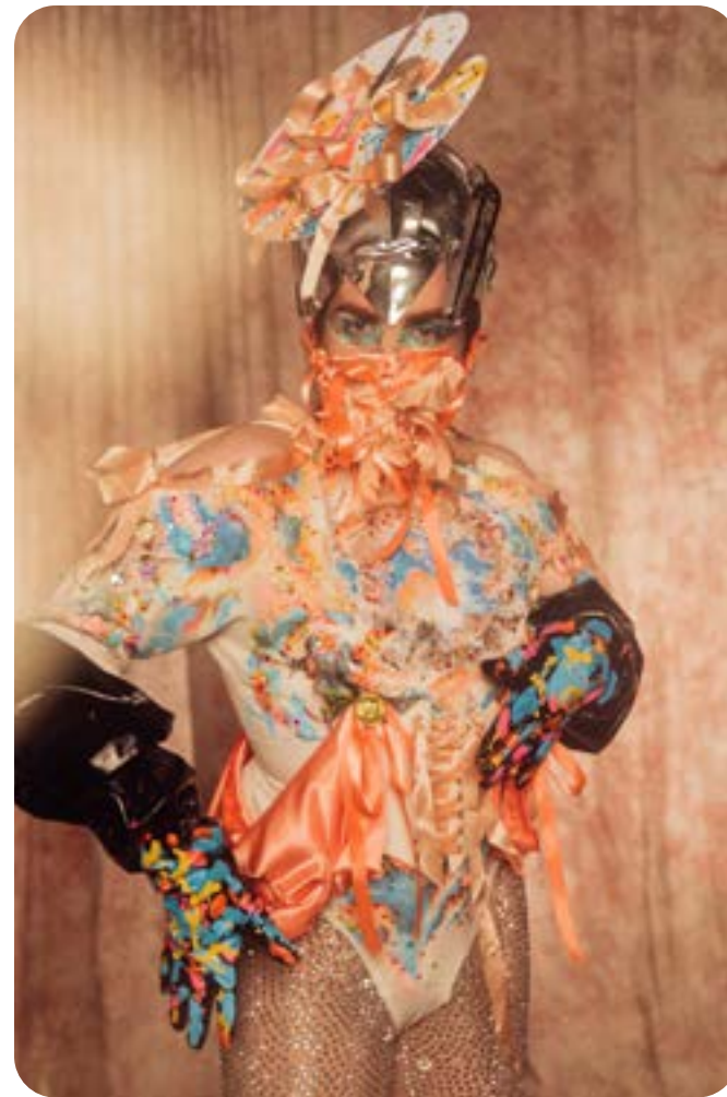
BOWERYTOPIA Portraits by Georgia Wallace

Climaxing with the infamous Bowery Costume Competition, the audience donned incredible home made costuming which were documented by Georgia Wallace - the results can be seen here .