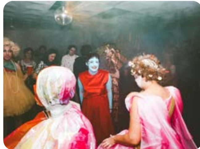
Bowery Bowl, October 2016