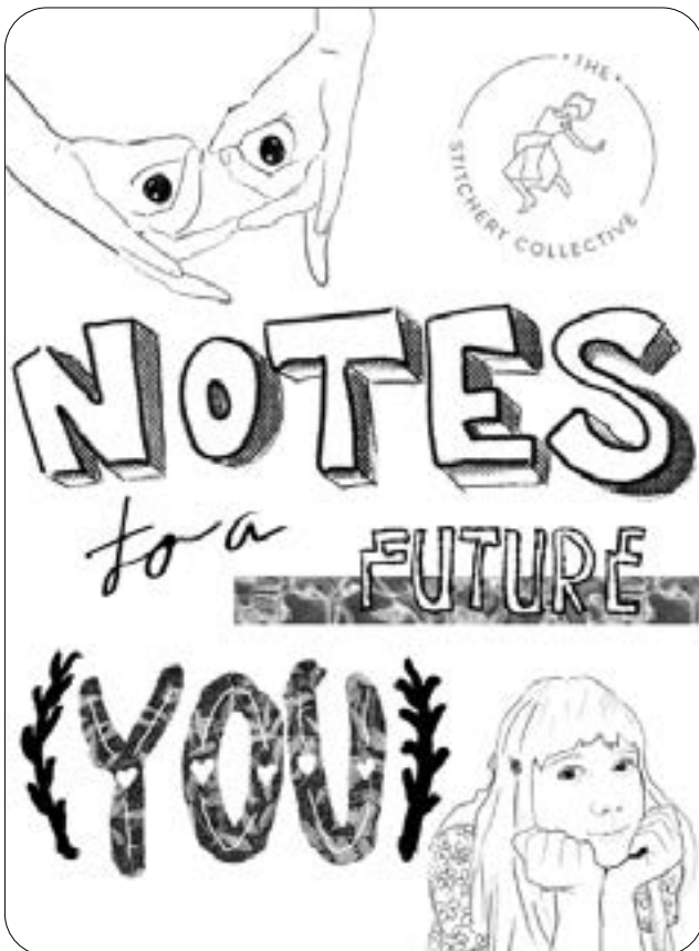
Cover Illustration of Student Workbook developed by The Stitchery Collective for regional schools as part of Digital Artist ZResidency at RMOA, 2022